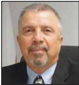
Vice Mayor Charles Vickers