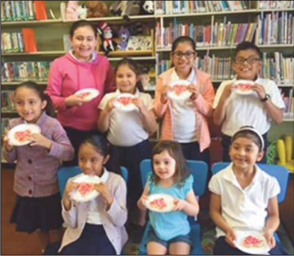
Everyone enjoyed a Valentine’s cookie to celebrate during February’s Story Time.